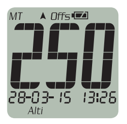
Configure offset altitude

Ground mode with an offset set as landing zone at +250 m from take off place