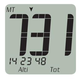
Lowest pull altitude